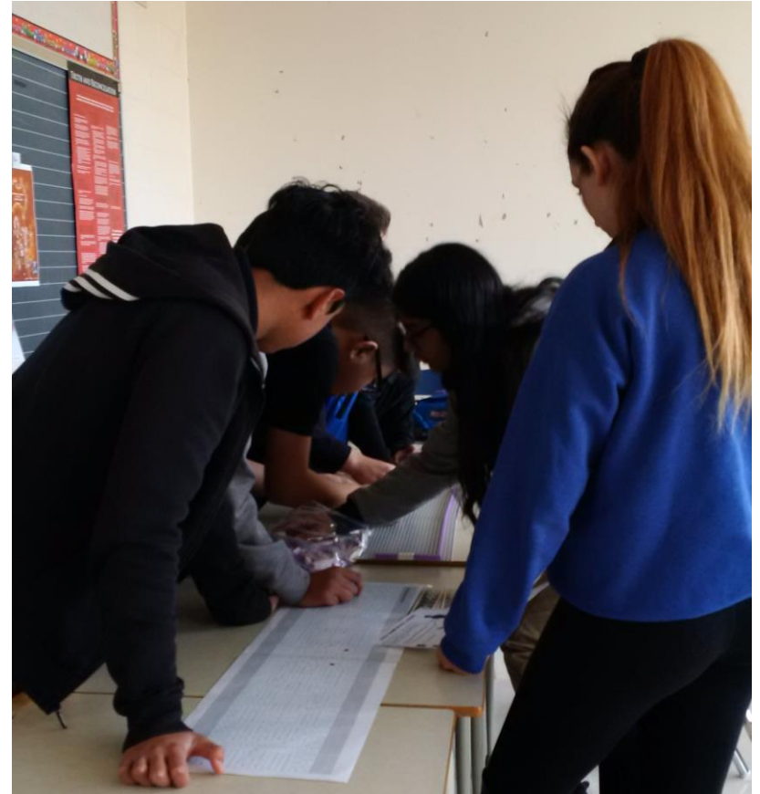
Gr. 9 Geography Students (Applied and Academic) learning about Treaties and Wampum